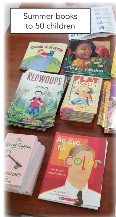
Summer books to 50 children