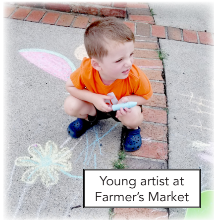
Young artist at Farmer's Market