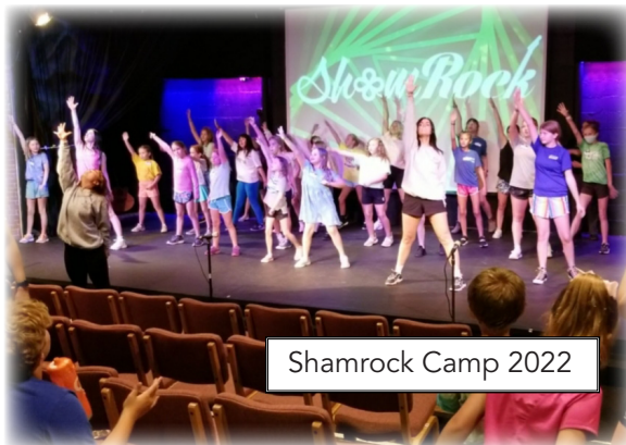
Shamrock Camp 2022