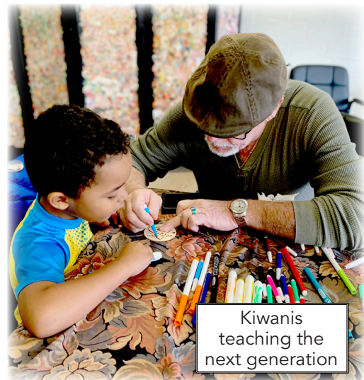
Kiwanis teaching the next generation