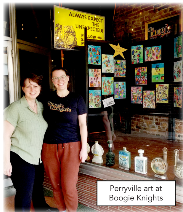
Perryville art at Boogie Knights