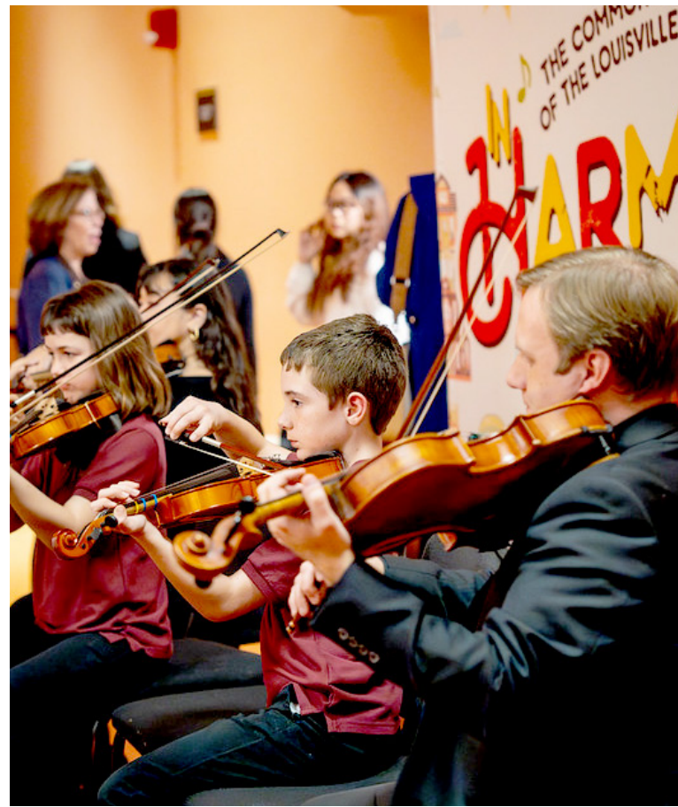
Pictured above HASP students and the crowd.

Save the date for Scarlet Cup benefit on May 11th at Library.