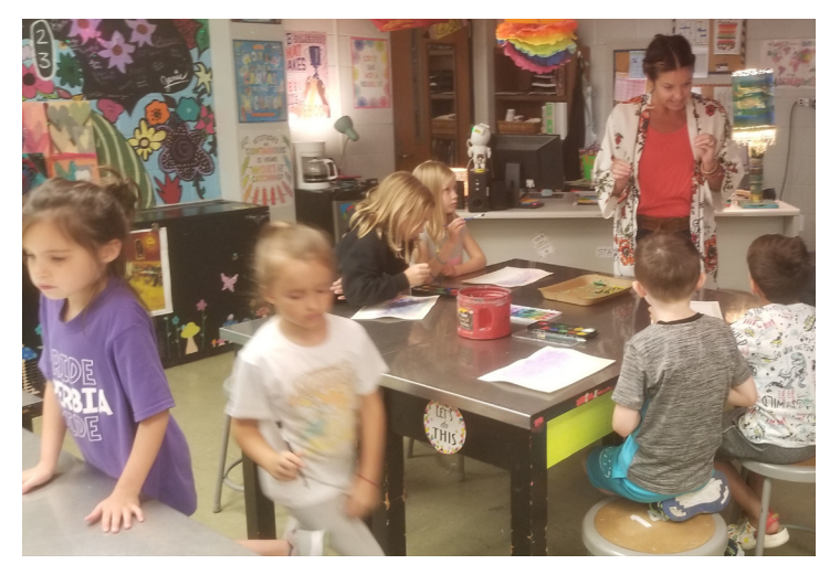
Visiting at Burgin