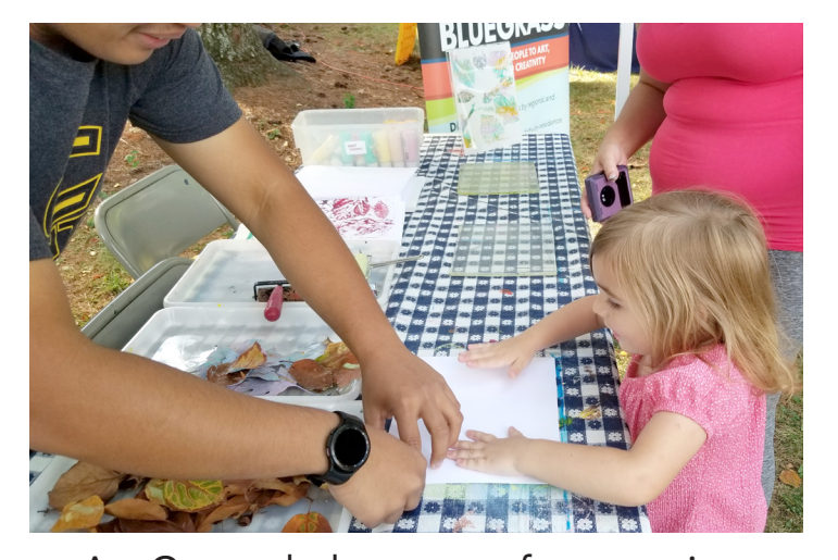
Art Center helps create future artists