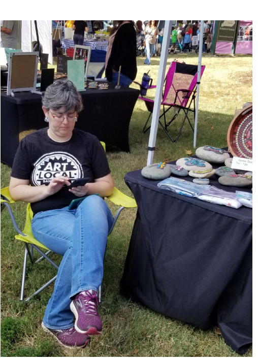
Kate takes a break from a busy day