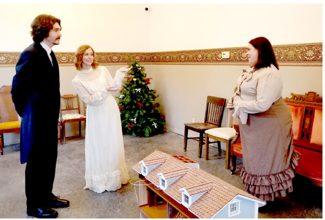
A Doll's House finishes successful run