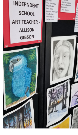
Burgin student exhibit at Raymond James